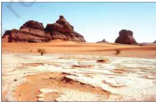
Fig. 7.1: The Sahara Desert

Look at the map of the world and the continent of Africa. Locate the Sahara desert covering a large part of North Africa. It is the world's largest desert. It has an area of around 8.54 million sq. km. Do you recall that India has an area of 3.28 million sq. km? The Sahara desert touches eleven countries. These are Algeria, Chad, Egypt, Libya, Mali, Mauritania, Morocco, Niger, Sudan, Tunisia and Western Sahara.