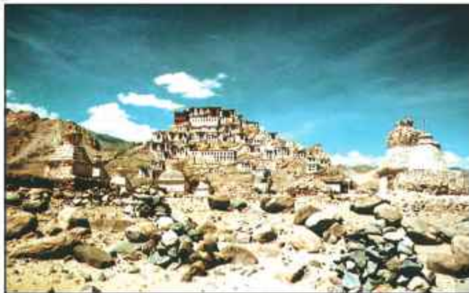
Fig. 7.5: Thiksey Monastery

The finest cricket bats are made from the wood of the willow trees.