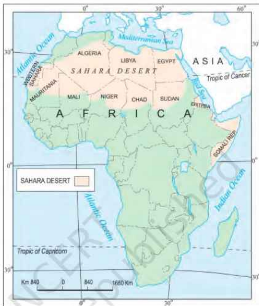
Fig. 7.2: Sahara in Africa

You will be surprised to know that present day Sahara once used to be a lush green plain. Cave paintings in Sahara desert show that there used to be rivers with crocodiles. Elephants, lions, giraffes, ostriches, sheep, cattle and goats were common animals. But the change in climate has changed it to a very hot and dry region.