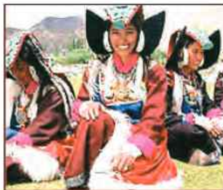
Fig. 7.6: Ladakhi Women in Traditional Dress

Life of people is undergoing change due to modernisation. But the people of Ladakh have over the centuries learned to live in balance and harmony with nature. Due to scarcity of resources like water and fuel, they are used with reverence and care. Nothing is discarded or wasted.