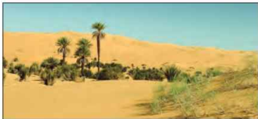
Fig. 7.3: Oasis in the Sahara Desert

snakes and lizards are the prominent animal species living there.